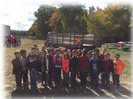
Students from Room 102 at Steere Orchard.

All Kindergarten Feinstein Junior Scholars went on a trip to Steere Orchard to pick apples in October.