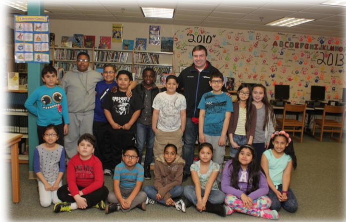
The sports anchor from abc6 News visits the school!